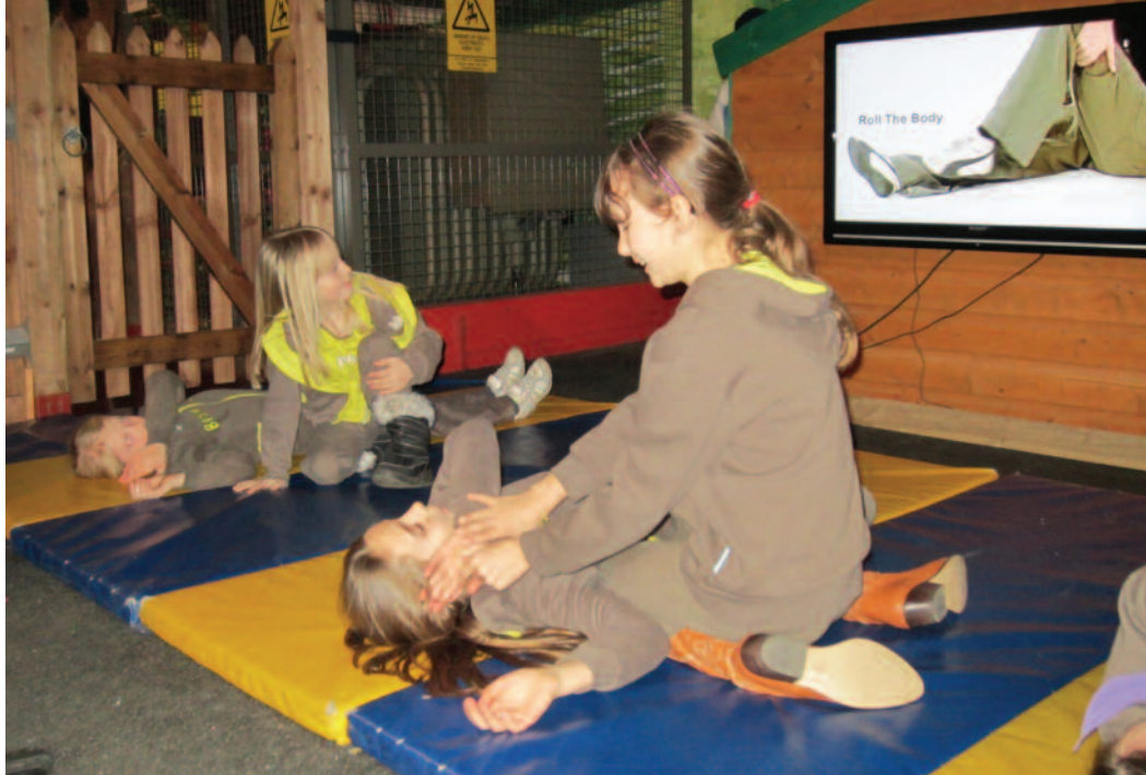
Children are pictured learning about the recovery position during a visit to the Safety Centre.