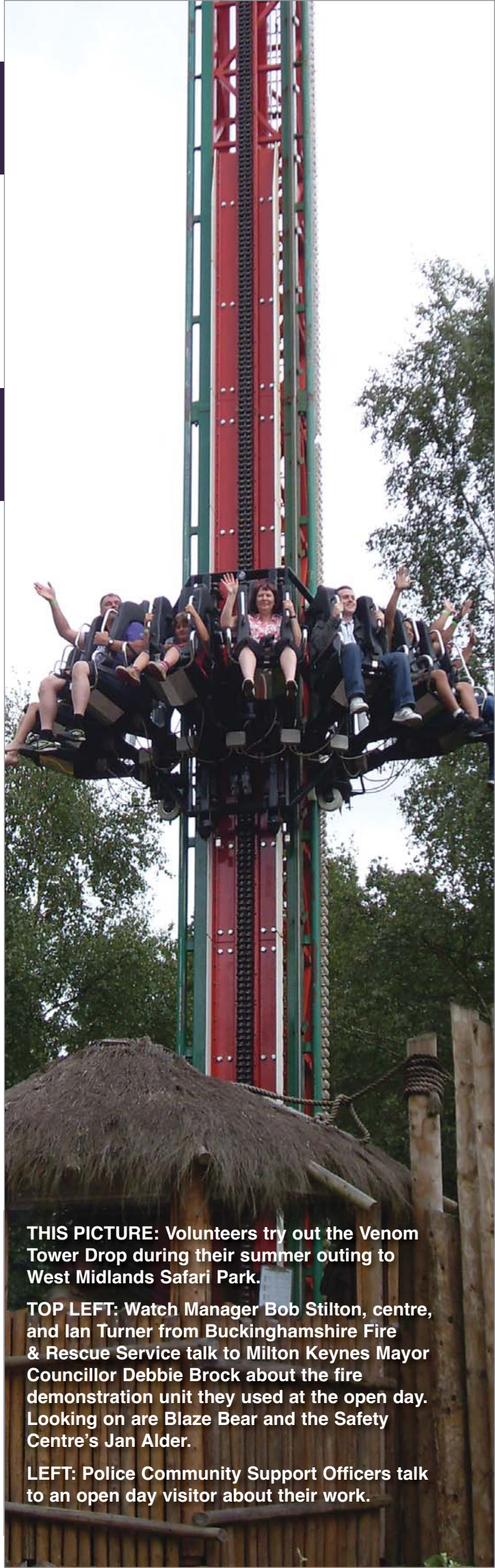
THIS PICTURE: Volunteers try out the Venom Tower Drop during their summer outing to West Midlands Safari Park.