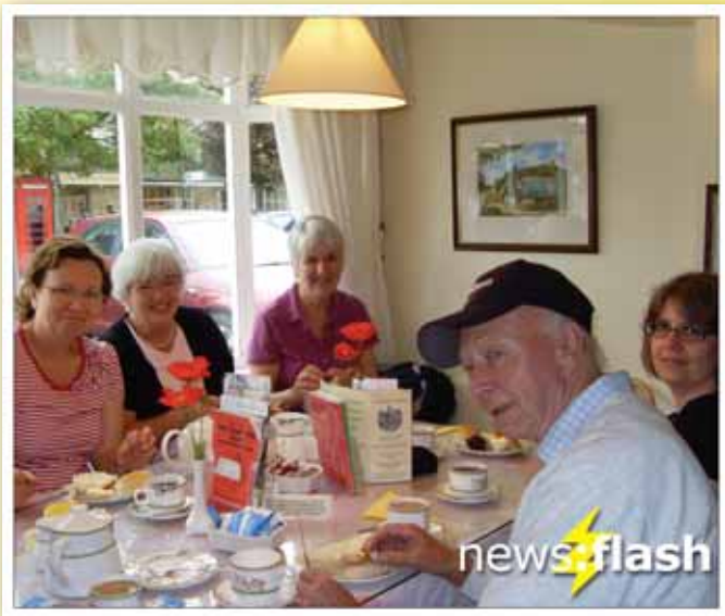
■ The Safety Centre's volunteers visited Bourton on the Water and Blenheim Palace for their summer outing in 2009.