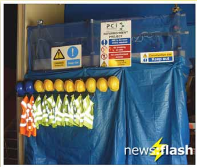
■ We strive to improve and update our scenarios whenever necessary. This is our new building site scenario, complete with hard hats!