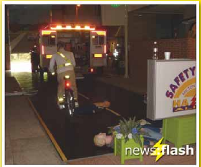
■ The Safety Centre was hired for a day by the East of England Ambulance Service, who trained their paramedic using our lifelike scenarios.