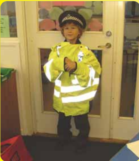
Left: A pupil "reflects" on what he has learned from the classroom input.