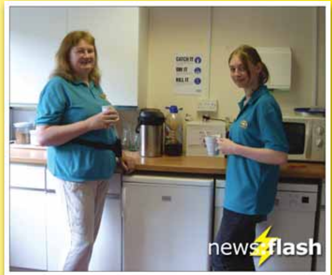
■ Many thanks to the John Lewis Partnership for their kind donation of a fridge for our volunteers' rest room.