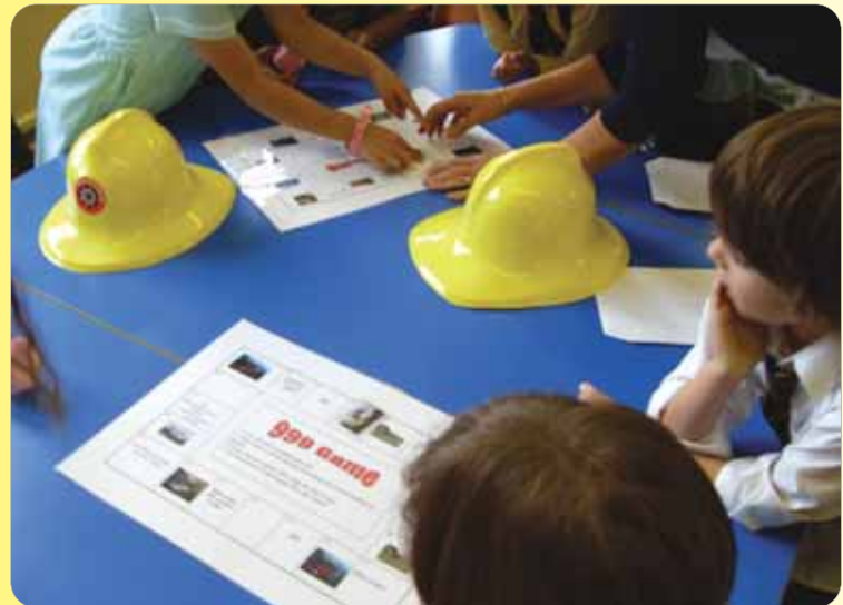
Right: The lessons feature a 999 game to help reinforce key messages.

FUNDING from Milton Keynes Council has allowed the Safety Centre to deliver classroom input for Year 2 pupils in Milton Keynes.