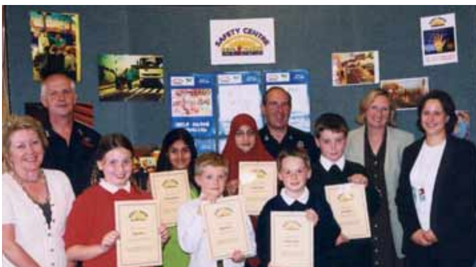
Anti-vandalism poster competition winners receive awards.