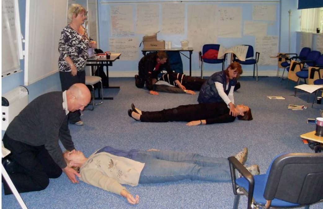
A First Aid course taking place in our conference room.